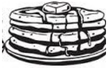
Clipart Of · 1167532

Our monthly breakfast will start up again on Saturday, October 24 th . We will be serving the usual – scrambled eggs, bacon, breakfast sausage, pancakes, biscuits and gravy, juice and coffee – all for $5. Non-members pay $6. Sign up now.